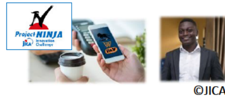
NINJA and ABE Initiative ABE Initiative alumnus (Ghana)'s participation in the NINJA Business Plan Competition (Finalist)