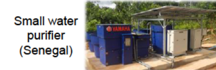
Small water purifier (Senegal)