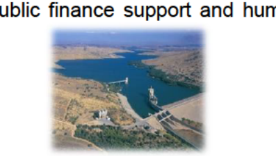
Support for dam upgrading project formulation (Tunisia)