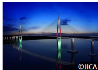
Mombasa Gate Bridge (Kenya) (conceptual drawing) ©JICA