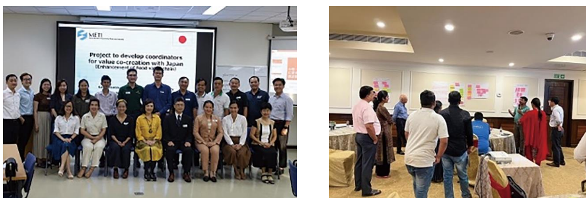
Column Figure 5-2. Scenes from training programs for local coordinators

Note: Scenes from training programs for local coordinators in Viet Nam and India