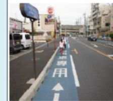
Standard bicycle lane