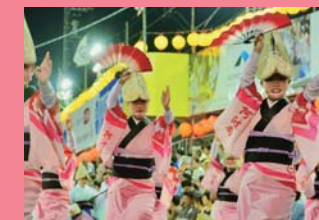
Awa Odori Festival