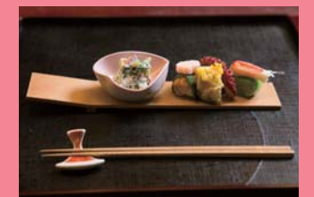
Washoku (Japanese Cuisine)