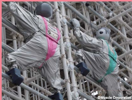
Cutting-edge humanoid climbing robots, co-developed by several Kansai enterprises, and exhibited at the EXPO 2010 SHANGHAI.

The Kansai region is home to a high concentration of world-class biomedical clusters comprised of numerous research institutes and corporations as well as a hub for various types of advanced technologies.