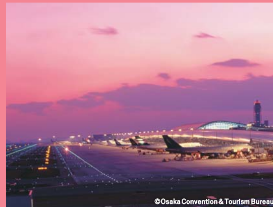
Evening at Kansai International Airport

The Kansai region is serviced by three world-class airports and two large seaports. Kansai International Airport offers over 1,200 international flights a week. Kansai is also connected to the rest of Japan through superhighways that stretch across the country, and world-famous bullet trains (Shinkansen).