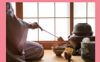
Sado (Japanese tea ceremony)