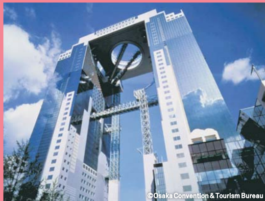
The first ever interconnected skyscraper, Umeda Sky Building embodies Osaka's challenger spirit.

Kansai, with Osaka as its hub, is a region with a daring spirit to challenge, and a rich culture that blends the traditional with the modern. The city has born many unique ideas and inventions, like instant noodles, karaoke, and conveyor-belt sushi, which benefit the daily lives of many.