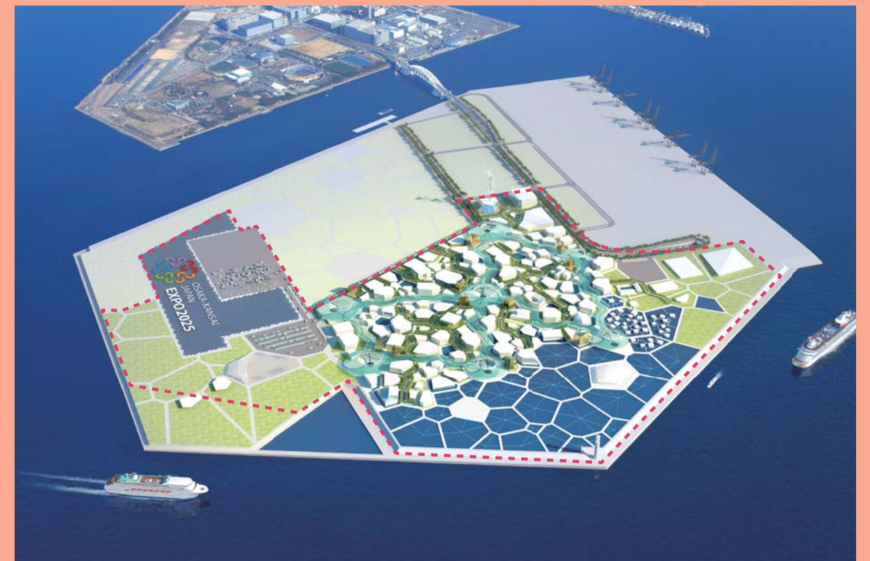
Yumeshima Island (Dream Island in Japanese) is a man-made island that will host the Expo and help realise the concept of EXPO 2025 OSAKA.

The venue plan reflects our vision of a future society through its key concepts of decentralisation and dispersion. Randomly placed pavilions represent individual citizens across the globe, making the Expo reflective of a future society that will be created by all people on this planet.