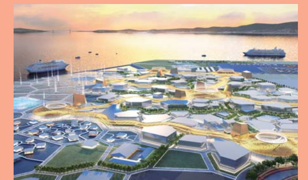
The layout of pavilions and site configuration highlights the diversity and uniqueness of the EXPO 2025 OSAKA venue concept.