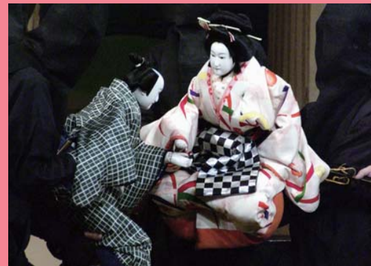
Bunraku: Traditional Japanese puppet theater that expresses the most delicate of emotions, and has been recognised as a UNESCO Intangible Cultural Heritage.

For more than 1,600 years, the Kansai region, was home to Japan's capital. Astoundingly, half of Japan's National Treasures and 5 UNESCO World Heritage Sites can be found in the Kansai region.