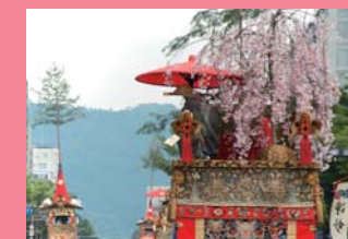
Gion Matsuri Festival