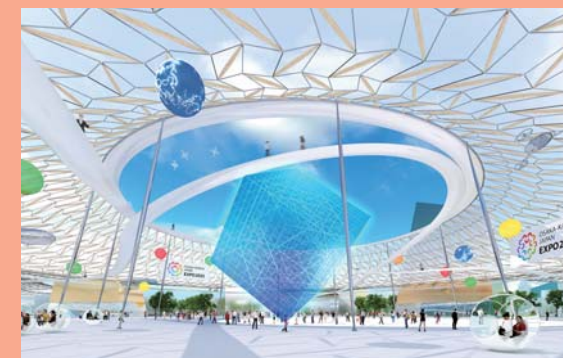
The Khus , major plazas within the Expo, will be the highlights of interaction and co-creation.